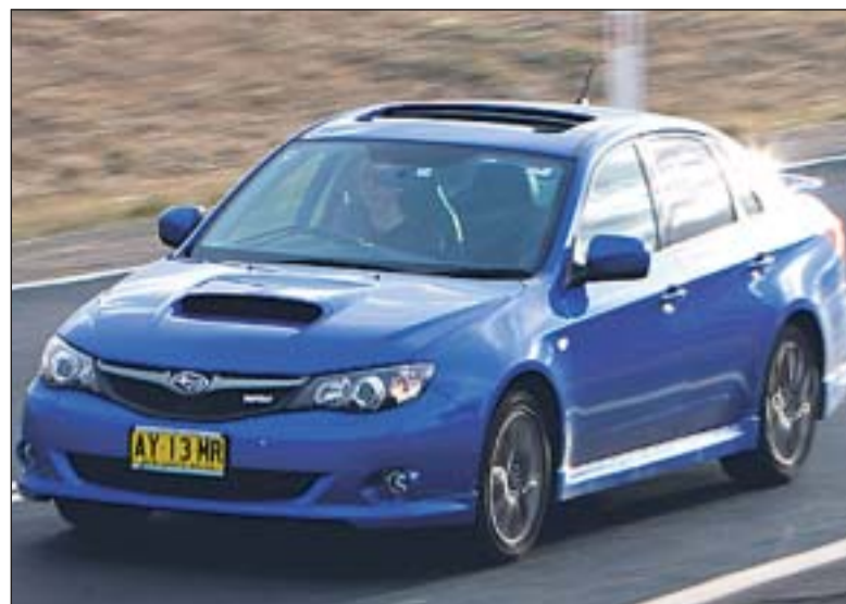
Brand new baby: Make certain your pride and joy doesn't end up as valueless scrap metal.

When you purchase a car insurance policy you will agree to pay a premium, that is, a regular amount that covers the cost of the insurance, and